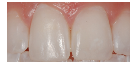
After Icon treatment, the beautiful, natural look of the treated teeth are restored!