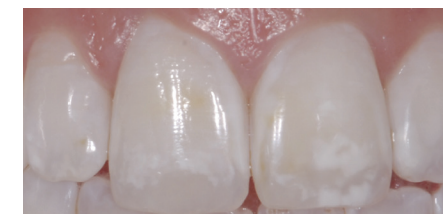
White spots before Icon treatment.

No drilling or anesthesia is needed to cosmetically remove white spots with Icon. And, unlike other treatments, you only need to make one visit to the dentist!